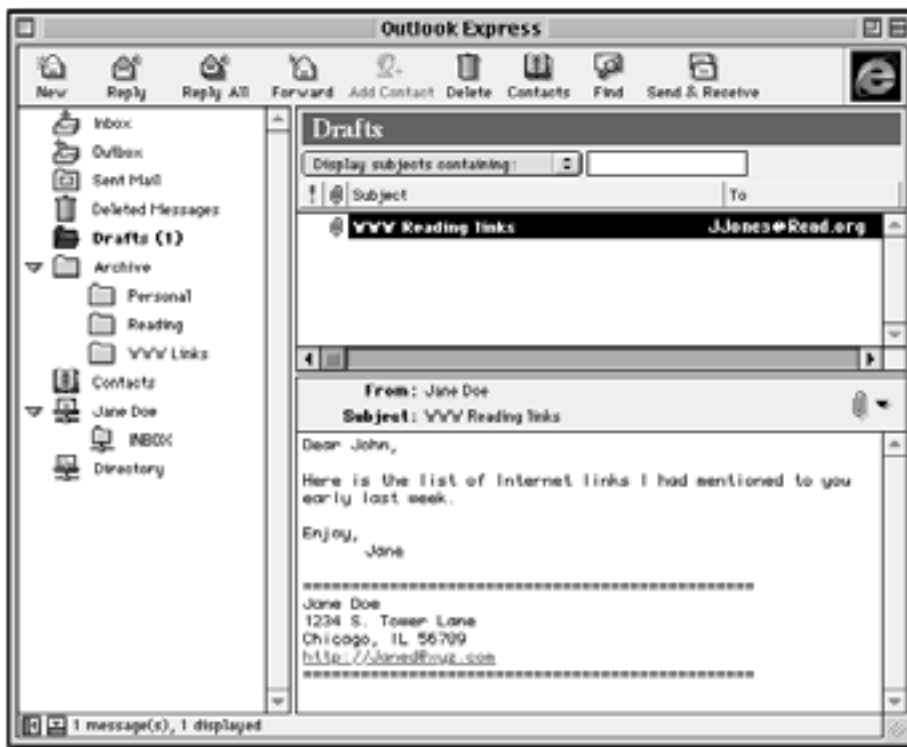
Sample e-mail message in an Outlook Express account

E-mail Electronic mail, or messages sent from one person to another via computer.