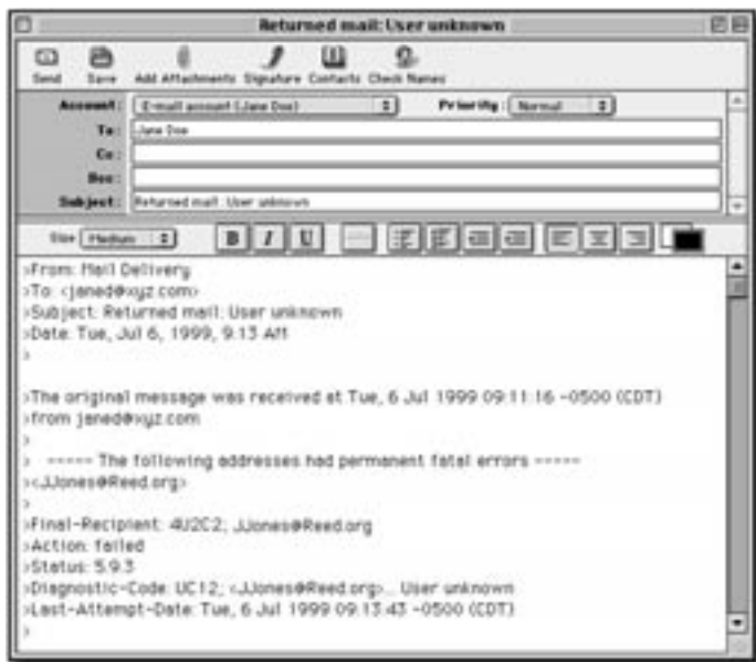
Example of returned e-mail message

Most e-mail addresses can be typed in all lower-case letters, all capital letters, or a combination of the two. However, some addresses are "case dependent," meaning you need to type them exactly as they appear or the message will be returned to you, marked as undeliverable.